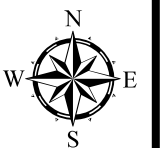
Figure 1 (Sheet 5E of 5) Base map date: November 2015 Refer to CTP document for more details